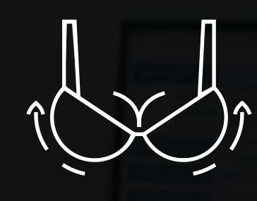
SURGERY TIME 1 - 1.5 HOURS