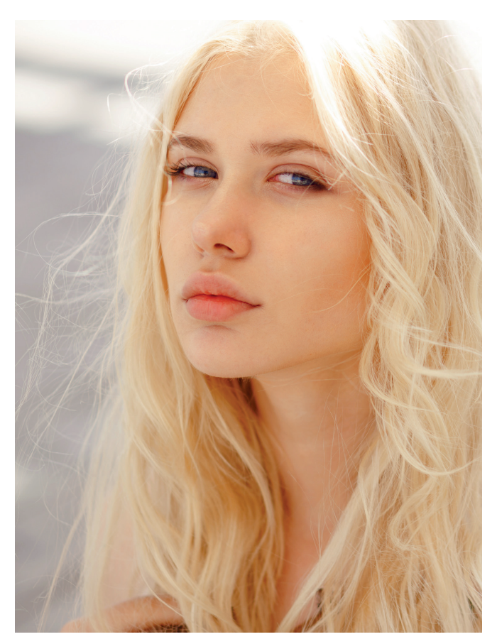
Full lips have always been associated with youth and beauty. Because of this, lip enhancement is one of the most frequently requested procedures in a cosmetic practice.

The objective in treating the upper lip is to artistically create a form that harmonizes with the patient's unique facial features and takes into account the age and ethnic background of the patient. The goal in treating the lower lip is to create bulk and greater prominence and artistic projection of the vermilion. The physician must establish appropriate guidelines and patient expectations for augmentation relative to normal lip proportions in order to avoid a cartoon-like appearance.