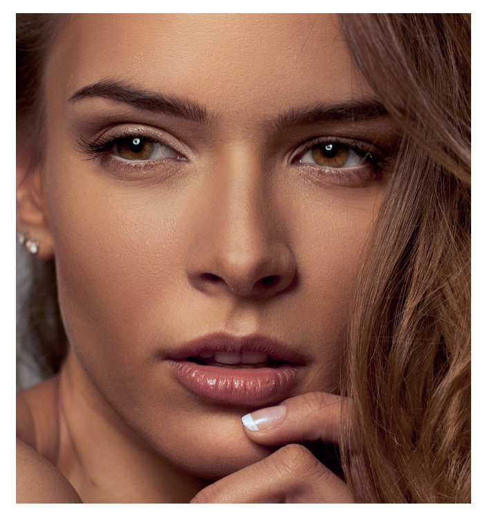
WHICH FILLER IS THE BEST FOR WHICH TREATMENT?