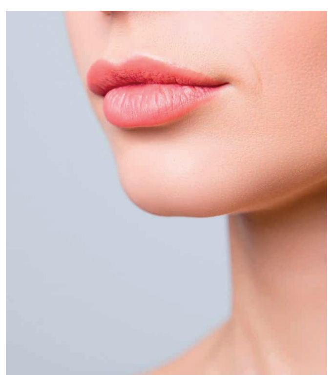
to 8 - 10ml of filler, which is obviously administered in 2 to 3 separate treatments.