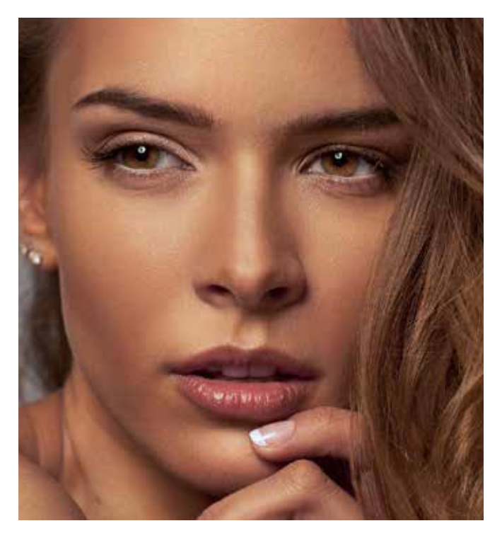
WHICH FILLER IS THE BEST FOR WHICH TREATMENT?