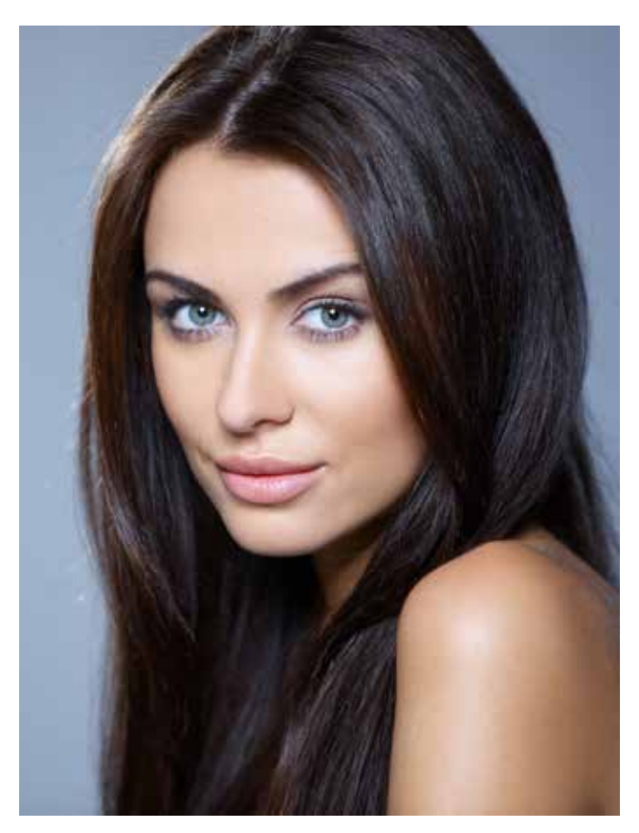
Typically, a facelift treatment lasts between one and three hours and is performed under general anaesthesia. Sometimes, more involved and involved procedures take longer.

A facelift technique seeks to restore a more youthful and refreshed facial appearance by reviving the facial area's appearance. The technique entails removing extra skin from the area around the ears and tightening the platysma, the muscle that lies beneath the covering skin. This lifting procedure is frequently combined by Dr. Vigo with volumizing procedures such fat grafting to the chin, jawline, lips, cheeks, and temples.